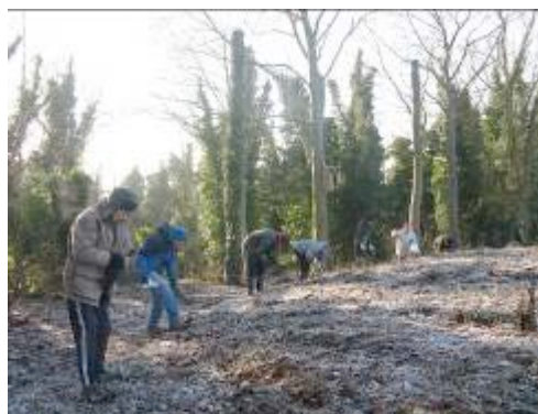
On the Bowl Barrow

A representative of the Trust will be attending the Lowland Calcareous Grassland Summit - a seminar to consider what blockages there are to the restoration of calcareous grasslands to their historic sites and what might be done collectively and cooperatively to overcome those